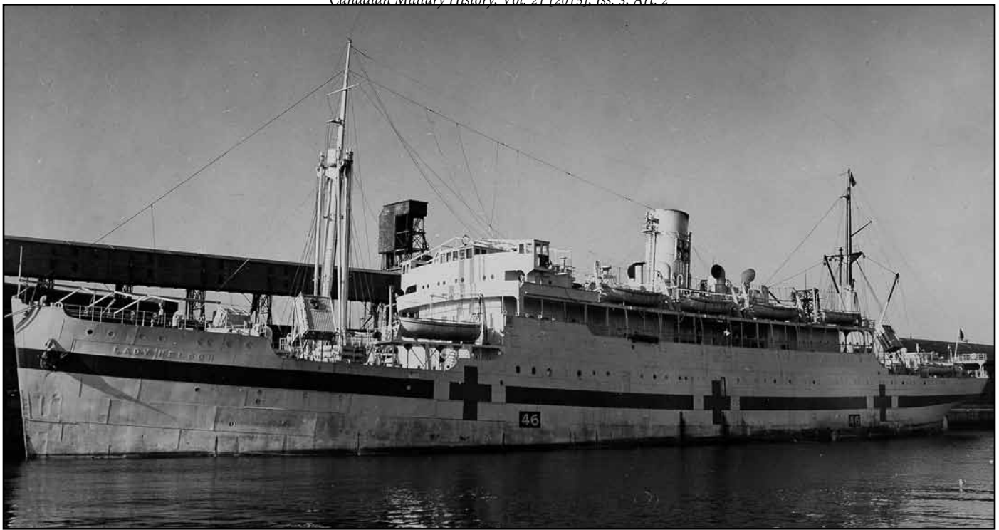
The SS Lady Nelson was a Canadian hospital ship used to repatriate sick and wounded German prisoners of war.

the UK and Germany to exchange sick and wounded prisoners. 42 In addition, these complaints came to light around the same time as the shackling controversy of 1942-1943, which also began after Dieppe in August 1942. 43 Upon confiscating an Allied document that recommended Canadian troops bind all Germans taken prisoner "to prevent the destruction of their documents," the German government responded by shackling Canadians captured at Dieppe. The UK and Canada reacted to this measure by ordering that German POWs in Canada also be bound, which resulted in various types of resistance exercised by the POWs ranging from passive resistance at Espanola and Monteith to outright violence at Camp 30 in Bowmanville. 44