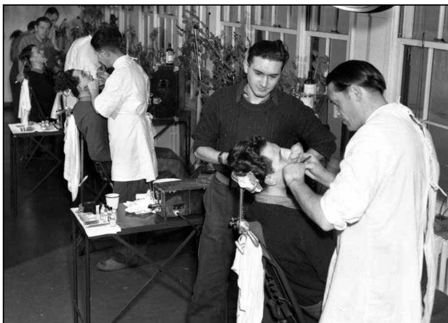
Below left: German POWs undergoing dental treatment at Camp 132 near Medicine Hat, Alberta.