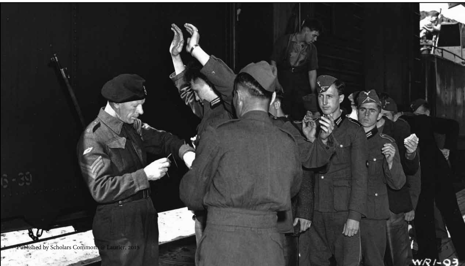
German prisoners are searched by Canadian guards upon their arrival in Quebec City, July 1940.

Significantly, when the Geneva Convention was amended in 1949, the provisions governing the Mixed Medical Commissions changed so that "prisoners of war who, in the opinion of the medical authorities of the detaining power, are manifestly in a serious condition shall be repatriated without having to be examined by the commission." 16 This post-war amendment reflects some of the difficulties that both the Canadian authorities and the commissions encountered, and forced the ICRC to adopt a less stringent position on repatriation for medical reasons. That German prisoners throughout Canada died from various illnesses ranging from cancers to diabetic comas highlights some of the practical difficulties of adhering to international law in wartime. It also raises questions about the extent to which any allied country could abide by such quixotic guidelines given the immense logistical challenges of