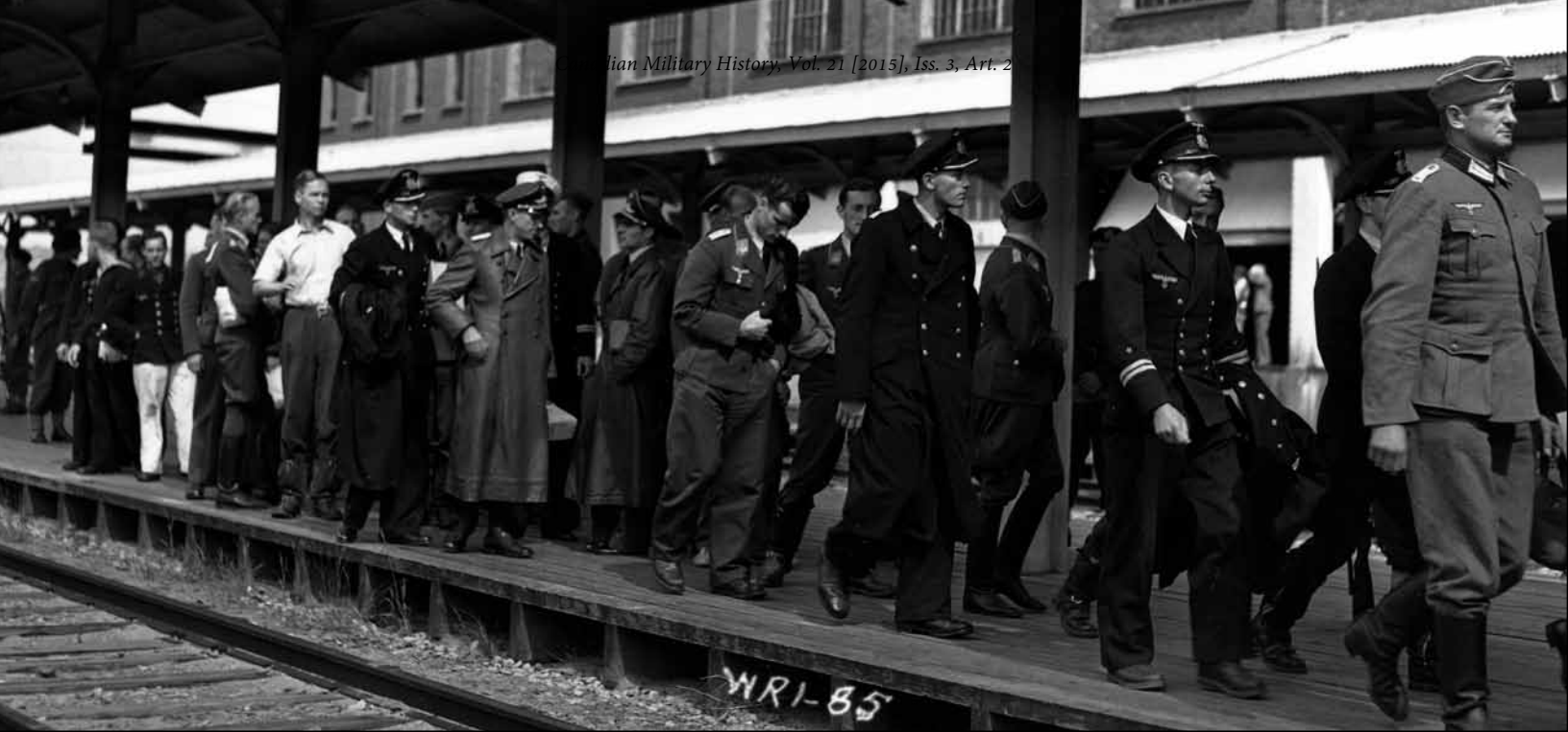
German prisoners arrive at the train station in Quebec City, July 1940.

history of POWs in Canada, with the central claim that the actions of Canadian authorities were justified by international law. These historians imply that Canada applied the convention uniformly and with very few exceptions. 7 This type of interpretation is misleading for a number of reasons, not least because it portrays contemporaries as using the convention as some type of gauge by which they measured their actions, but it also discards other considerations that significantly affected the treatment of POWs in Canada, such as the threat of reprisals against Canadian POWs in Germany. For example, in the summer of 1941 the German government, through the Swiss Consul, demanded that African-Canadian personnel of the Veterans Guard of Canada (VGC) should not be permitted to guard German officers. The Canadian government recognized that “at the time [1941], shortly after the evacuation of Dunkirk, the number of British PW held by Germany was many times greater than the number of German PW captured by the British. Consequently, the United Kingdom, Canada and other Commonwealth