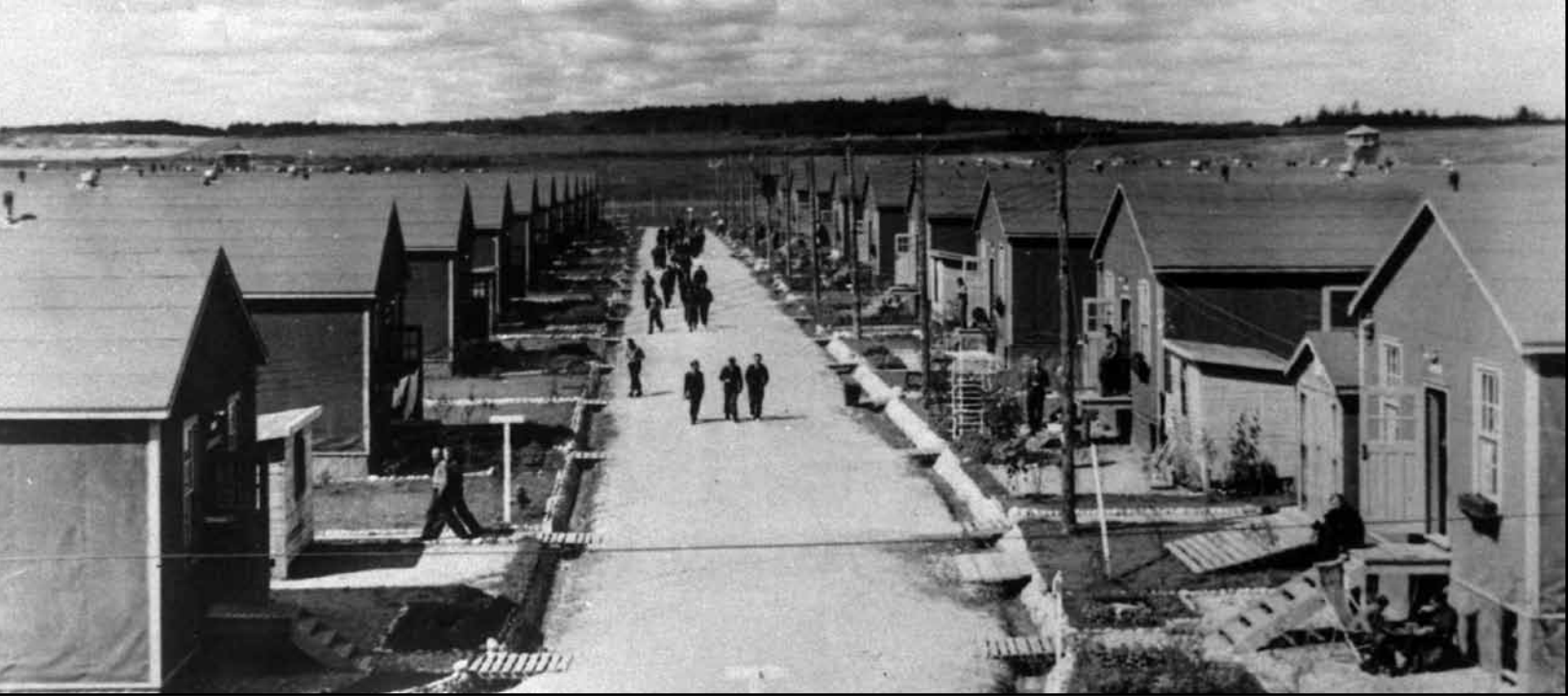
A view of Camp No.23 at Monteith, Ontario.

safely transporting POWs during the Second World War.